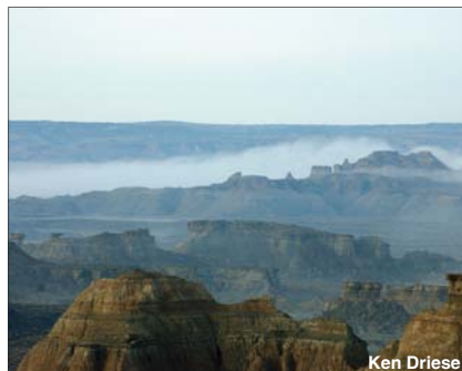
Mist settles over Skull Creek Rim

The thousand-foot palisades of the Skull Creek Rim present the geologic wonders of Adobe Town at a magnificent scale. Here, the lofty promontories descend through badlands banded in pinks and reds to the vast and empty desert floor below. Atop the rims, there is easy traveling through eerily eroded boulders and among sand dunes stabilized by sagebrush and prickly pears, lit in the early summer by the tiny blossoms of wildflowers.