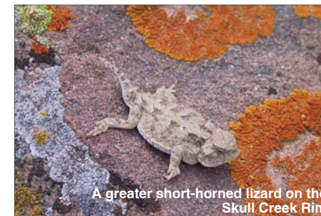
A greater short-horned lizard on the Skull Creek Rim