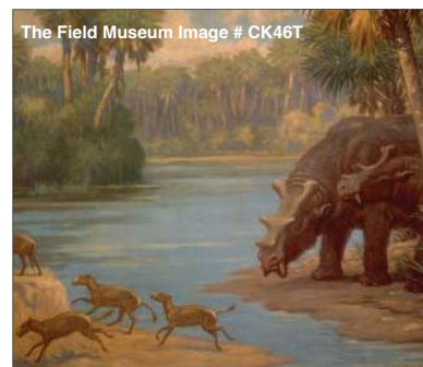
The Field Museum Image # CK46T

The Eocene epoch was an era of giant land mammals, and during this period, primitive horses, camels, rhinoceros-like mammals called uinatheres, and large relatives of the tapir called taeniodonts thrived in a subtropical climate that resembled the Everglades of today. Rich deposits of their fossil remains are found throughout Adobe Town, making this area one of the world's most important paleontological sites.