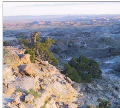
Junipers in The Haystacks glow in the sunset

Rising one thousand feet above the surrounding desert, The Haystacks are a broad arc of deeply dissected badlands that form the northern extension of the Adobe Town Rim. Loosely wooded in juniper, the many ravines and ridges of this area offer habitat to and abundance of wildlife from mule deer to mountain lions. This area is in "checkerboard" land ownership, with every other square in public ownership, dating back to the railroad land grants of the 1860s. Check with the Bureau of Land Management about current access rules.