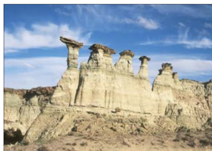
These striking spires are found on the Adobe Town Rim

One of the lower rims in Adobe Town, this is the area with the greatest complexity of geological features. Arches, window rocks, and mazes of pinnacles characterize this area, which shows off the variety and rare beauty that makes Adobe Town famous.