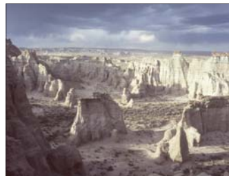
Pinnacles of the Adobe Town Rim

The story of the spectacular cliffs, spires, and arches of Adobe Town began 55 million years ago, during the Eocene epoch. Volcanic eruptions in the Yellowstone area belched huge quantities of ash into the sky, and rivers flowing down into Adobe Town carried the ash to deposit it in the Washakie Basin, where Ancient Lake Gosiute had recently dried up. This water-borne ash, coupled with volcanic ash carried by the winds, built up in a formation one thousand feet thick and ultimately solidified into tuffaceous sandstone.