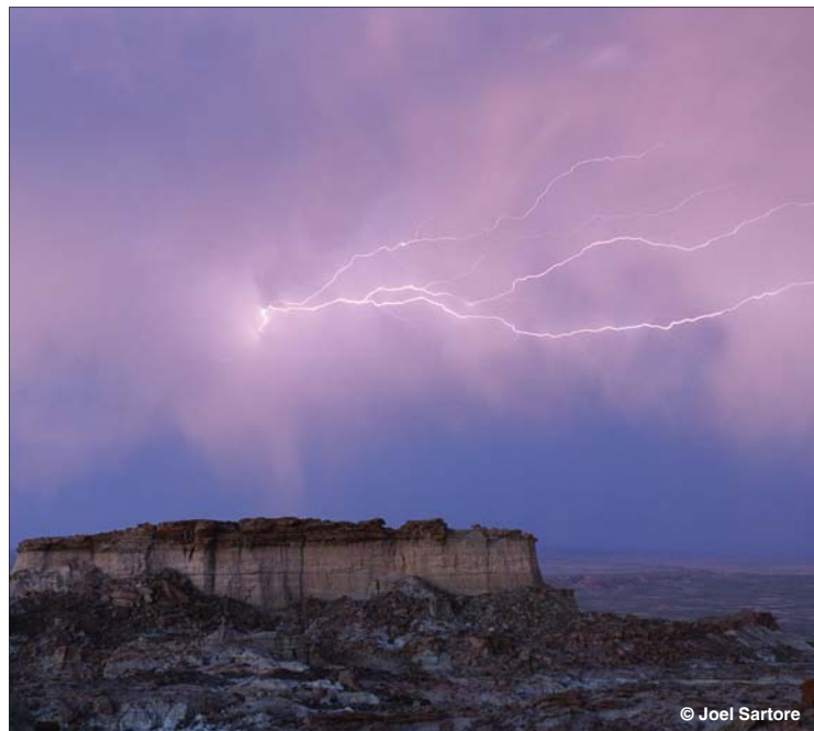
A lightning storm rages over Skull Creek Rim

Conservationists are proposing to protect Adobe Town as a Congressionally designated wilderness area, and are ultimately working toward a larger National Conservation Area that would include neighboring lands of conservation concern including the Kinney Rim, Prehistoric Rim, and historic Fort LaCledé.