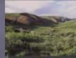
Wild Cow Creek proposed Wilderness