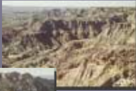
Adobe Town proposed Wilderness

Wildlands like Wild Cow Creek, the Pedro Mountains, and the lands surrounding Adobe Town are irreplaceable treasures that deserve to be protected as Wilderness Study Areas. This status allows wilderness-quality lands to remain pristine for the benefit of current and future generations.