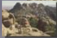
Pedro Mountains proposed Wilderness