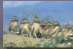
Burrowing owl nestlings

Wyoming's native wildlife is a treasure that we must conserve for our grandchildren to enjoy, so meaningful habitat protection should become a key part of the management of our federal lands.