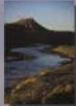
Medicine Bow River, threatened by coalbed methane drilling