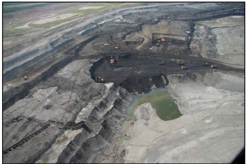
Canadian tar-sands extraction. Oil shale development is expected to be similar.

Oil shale and tar sands are the dirtiest and most environmentally destructive types of fossil fuels, requiring massive strip mines and smelting or "retorting" the rock to produce petroleum product, or else massive well pads with wells every ten feet that require bulldozing the entire landscape from which oil shale will be produced. In 2011, a lawsuit challenging oil shale development in which BCA was the sole Wyoming participant came to a successful conclusion. In a settlement inked with the Department of Interior, the Bureau of Land Management was forced to abandon its Bush-era Oil Shale and Tar Sands leasing policy and go back and re-do the Environmental Analysis. BCA was able to get several conditions inserted into the settlement to protect sensitive Wyoming lands, including a commitment that the new Environmental Impact Statement would consider full protection for the Adobe Town Very Rare or Uncommon Area as well as sage grouse Core Areas from oil shale leasing and development. This settlement puts conservationists in a favorable position to secure major concessions when the BLM takes up the issue of whether and how much to lease for commercial oil shale extraction in 2012.