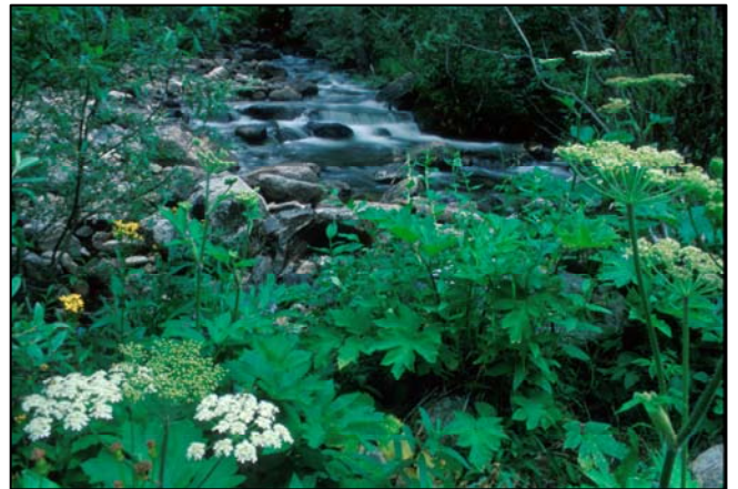
Roadless streamscape on the Medicine Bow National Forest.