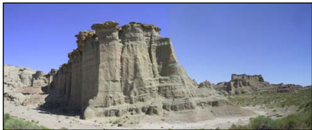
Adobe Town citizens' proposed wilderness.

Because Wyoming still has large tracts of intact ecosystems, many of the rare types of native wildlife once found throughout the West can still be found here. But pressures to drill for oil and gas have targeted Wyoming more than any western state, decimating wildlife populations. BCA's long and arduous campaign to reverse the tide of drilling and other habitat destruction is finally paying dividends now that a more wildlife-friendly administration is at the helm in D.C.